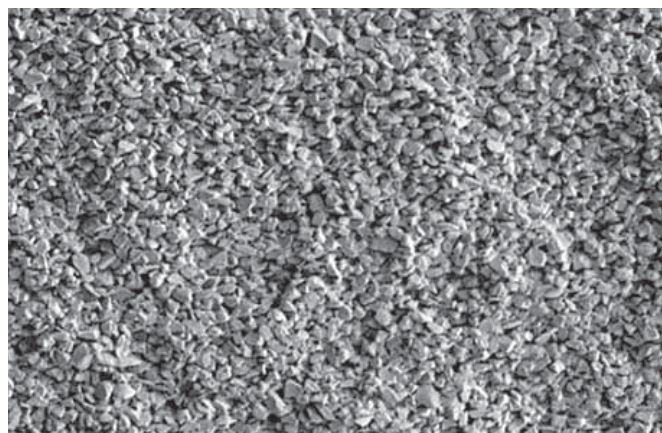
High Density (HD) Empore™ Membrane (10-12 µm particle size)